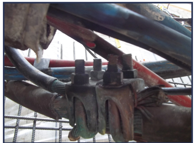
The bolts holding the grounds were facing up.